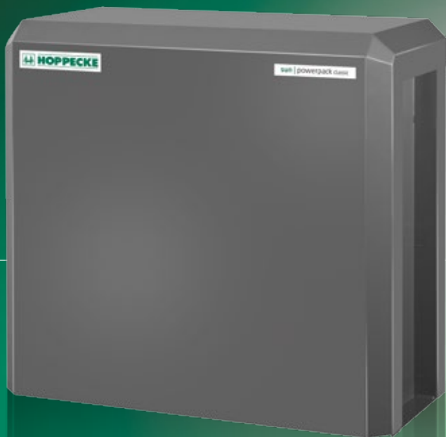
Similar to the illustration